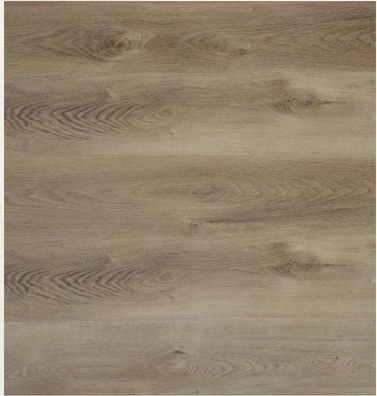
Natural Oak C2190