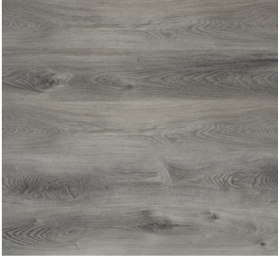
Carbon Oak C2188