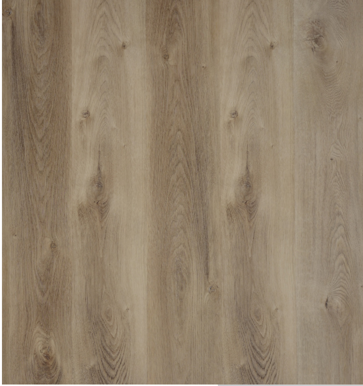
Canadian Warm Oak C2185