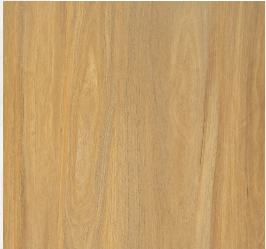
Weathered Spotted Gum C2184