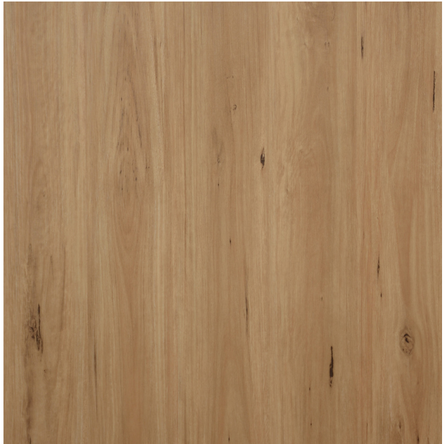
Coastal Blackbutt C2181

Each plank provides its own unique story with 5varying décor visuals that display stunning texture and natural colour variation .