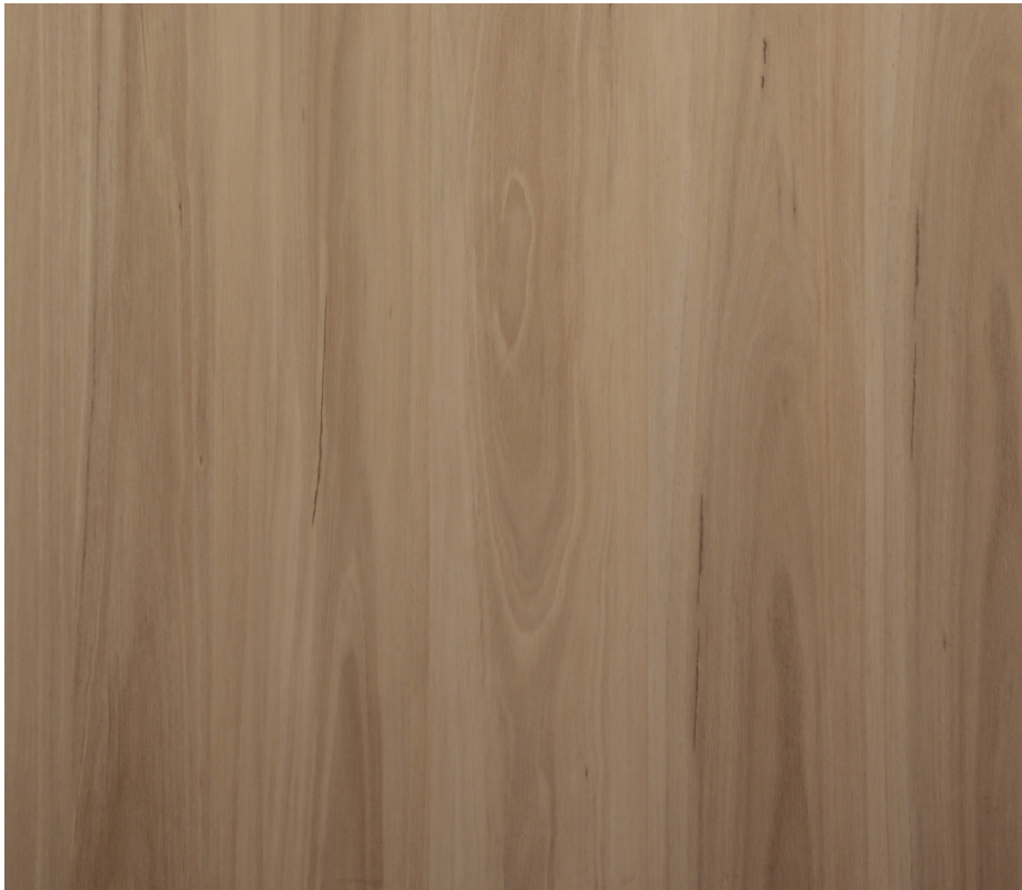
C2182 Natural BlackButt