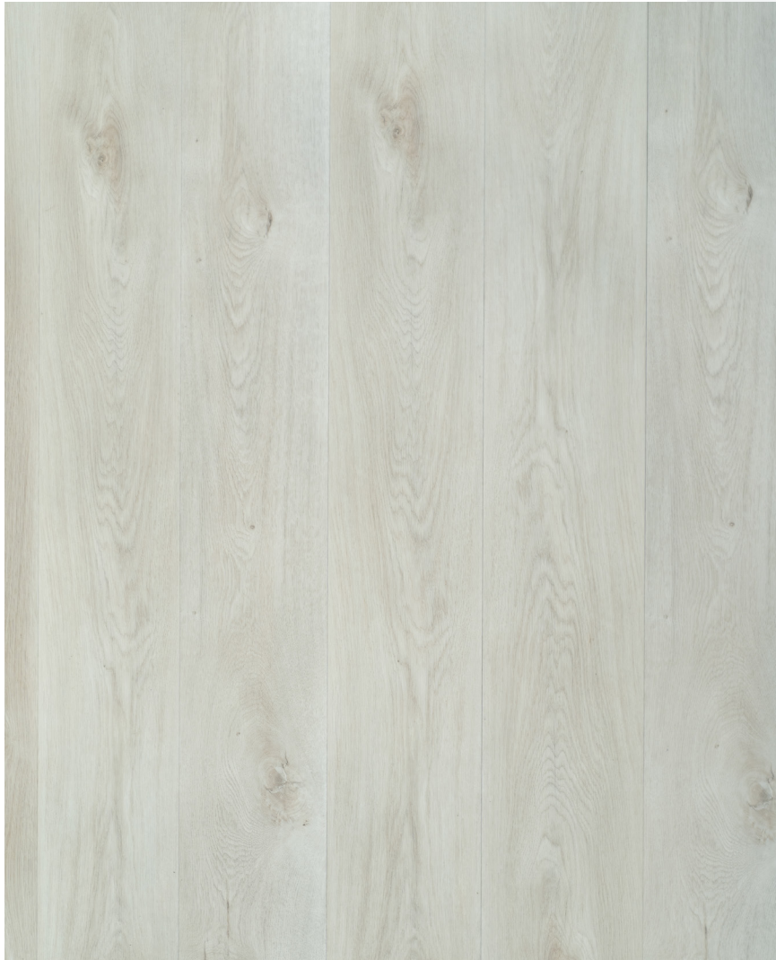
Silver Light Oak C2186