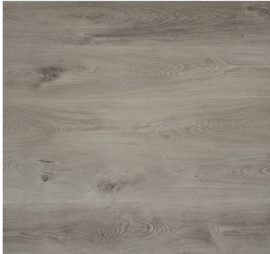
Grey Shadow Oak C2187